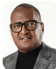
Mathew Knowles Advisor